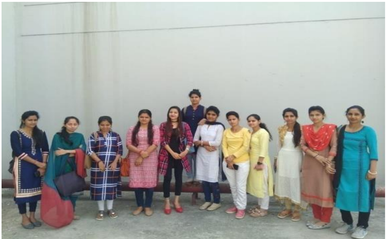
One Day Industrial visit to Rangoli Furnishings Pvt. Ltd., Kundli